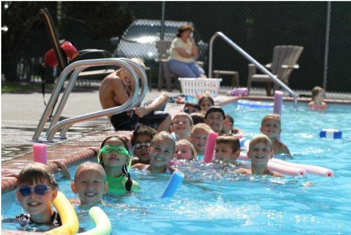
ATC Water Carnival 2010. So many smiles, you would think a dentist sponsored it.